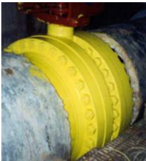
Above: Alocit 28.15 Tropical Yellow first 'index' coat.

Below: This close up of a finished flange with its second coat of 28.15 Tropical Gray, shows just how much condensation was on every surface. Coating on such wet surfaces proves beyond doubt Alocit's outstanding surface tolerance.