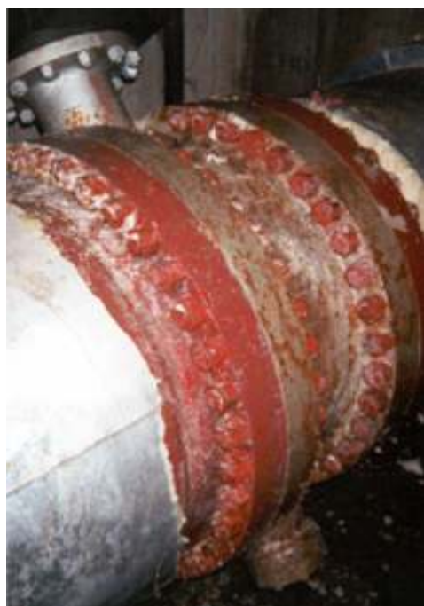
Above: 32" flange after removal of insulation showing corrosion.

The high moisture levels which had caused the corrosion also made re-coating impossible using any standard coating. The decision to use Alocit was based on its proven ability to be applied on to wet and damp surfaces.